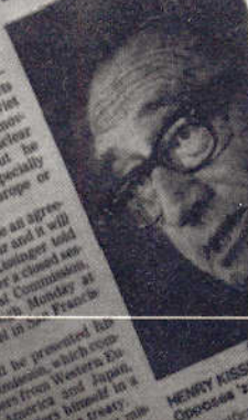
HENRY KISSINGER Opposes '87

Henry Kissinger said he expects the United States and the Soviet Union to sign an agreement on nuclear non-proliferation but he doesn't think it will be especially beneficial to Western Europe or the country.